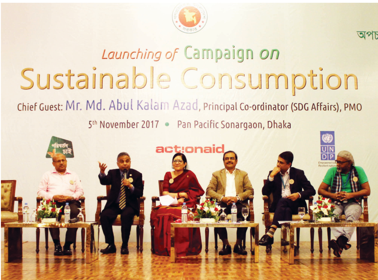
Md. Abul Kalam Azad, Chief Coordinator of SDGs of Prime Minister's Office, speaks at the inaugural session of a campaign titled 'Sustainable Consumption' organised by ActionAid Bangladesh and United Nations Development Program (UNDP) in a city hotel on Sunday.

The volume of transactions in the inter-bank call money market decreased slightly by 2.20 percent to almost Tk 6,434 crore on the day from Tk 6,579 crore in the previous day, according to the Bangladesh Bank latest data released on Sunday.