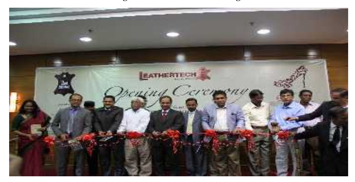
LFMEAB Organizes 2nd Leathertech Bangladesh Fair

LFMEAB organized 2nd Leathertech Bangladesh Fair from 27-29 November 2014 at Sher-E-Bangla Nagar, Dhaka. Many LFMEAB members participated in the fair along with renowned manufacturers, suppliers & distributors. Different machineries, accessories and raw materials of leather sector have been exhibited in the fair.