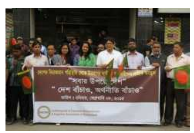
(FBCCI) in front of Association.

LFMEAB member factories are expected to be benefited by financial assistance in go green initiative from this project.